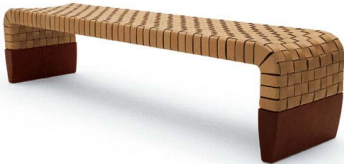
UL-400 bench design: Guglielmo Ulrich (1934)

... on display by Classique .... ideal for hospitality design.