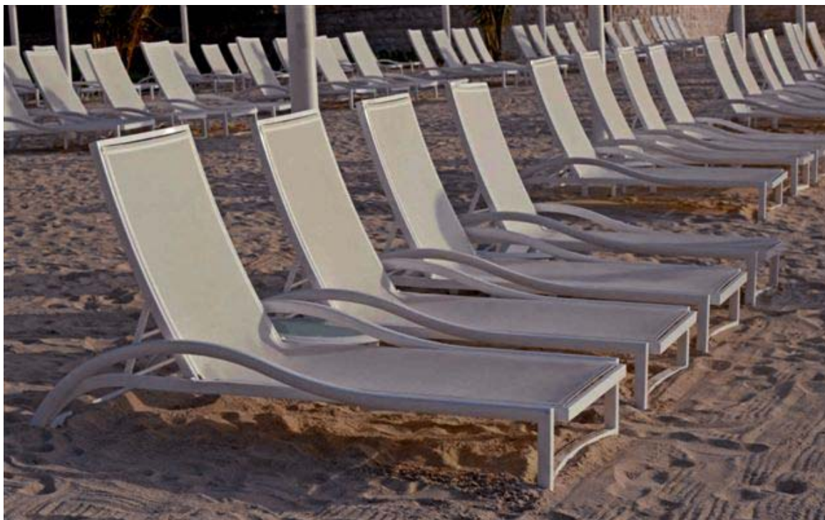
PREMIERE sunloungers design: Thomas Sauvage EGO Paris Shangri-La Hotel - Dubai