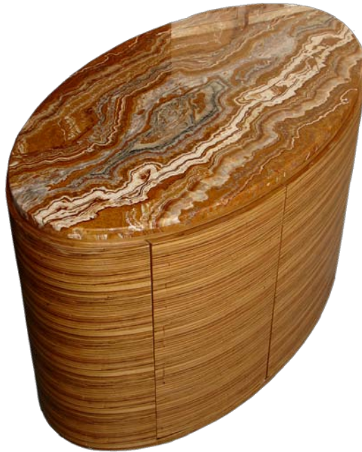
PASSION oval cabinet design: Elizabeth Tam Classique Special Projects