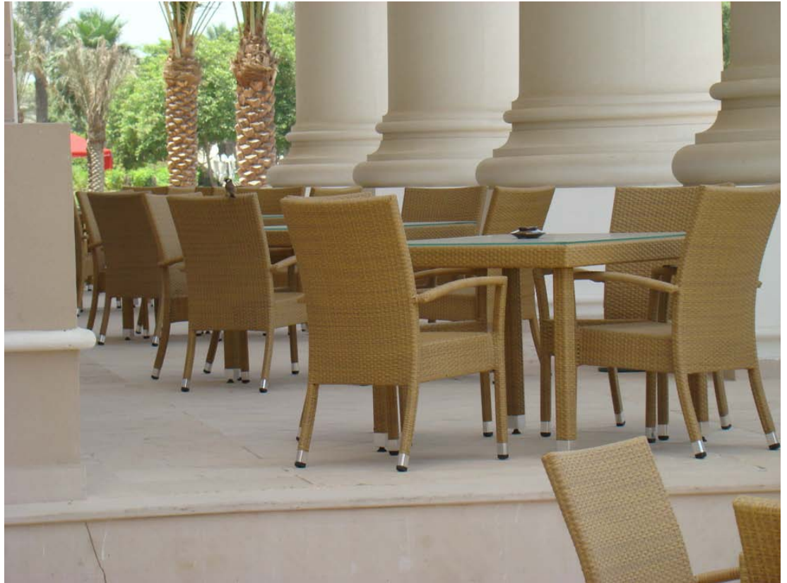
LAVANDOU armchair MANUKA tables design: Classique The Westin – Mina Seyahi Dubai

T: +61 2 4372 1672 F: +61 2 4372 1670 W: www.classique.net.au E: admin@classique.net.au