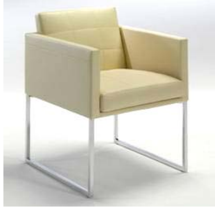
BRITT small armchair (swivel or sled base) design: T.Wise

T: +61 2 4372 1672 F: +61 2 4372 1670 V E