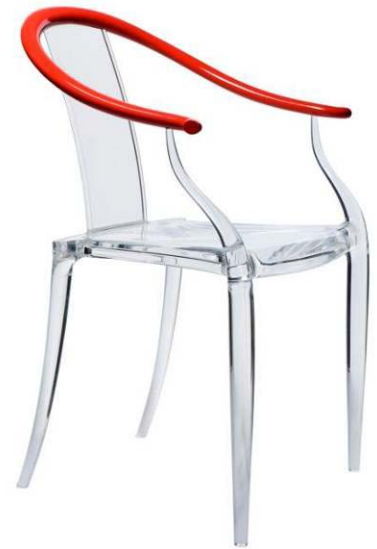
MI MING chair design: Philippe Starck