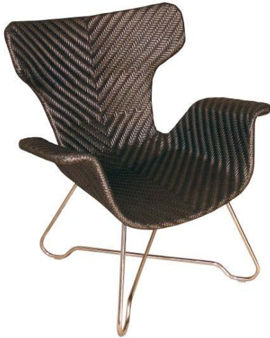
EMO LOUNGE design: Gaetano Cunsolo